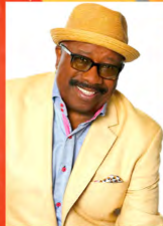
J. Anthony Brown