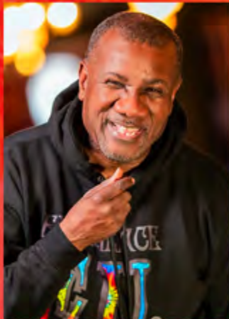
EU featuring Bear