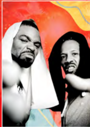
Method Man & Redman