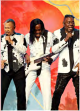
Earth, Wind & Fire